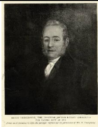
'The Voyage of the Mystery'